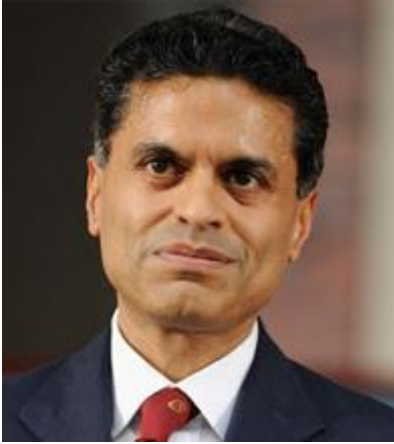
Dr. Fareed Zakaria

CNN Host and TIME magazine editor-at-large