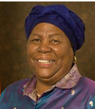
Grace Naledi Mandisa Pandor

Minister of Home Affairs of the Republic of South Africa