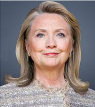
Hillary Rodham Clinton

Former Secretary of State and Former U.S. Senator from New York