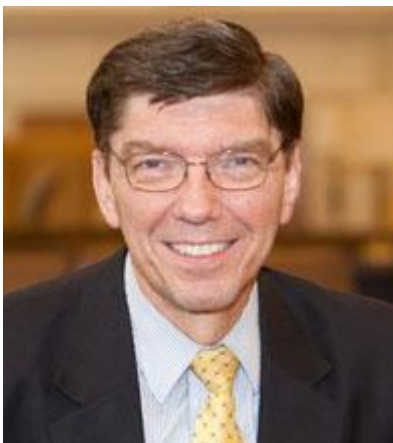
Dr. Clayton Christensen

Harvard Business School professor and eminent expert on disruptive innovation